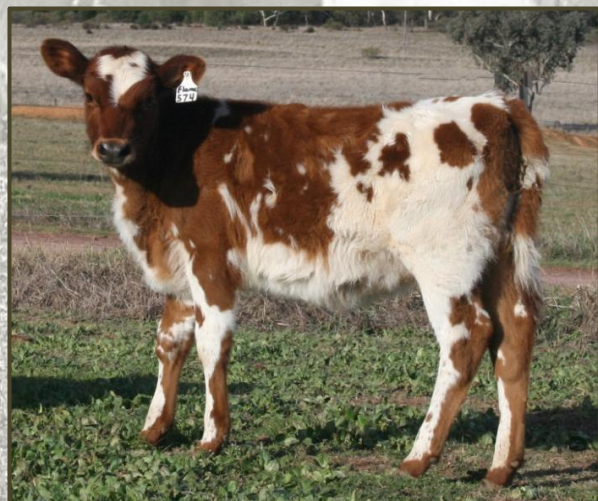
Paschendaele Flaming Sherry