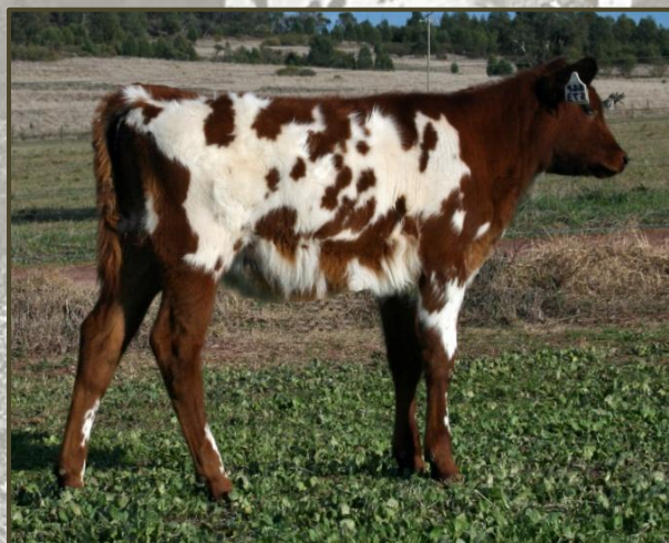
Paschendaele Kiwi Secret