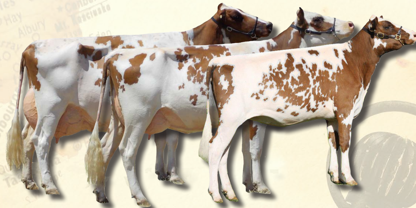
Boldview Let's Tri VG 89 All Breeds Champion Cow Mt. Barker Show 2013 3rd Aged Cow in Milk , IDW 2013