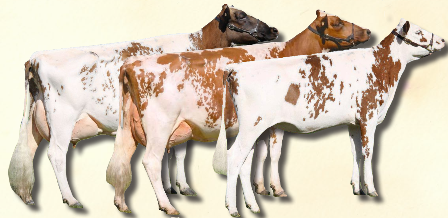
Cher-Bar Brigadaire Gem VG 88 1st 6yrs in Milk Adelaide. 2012