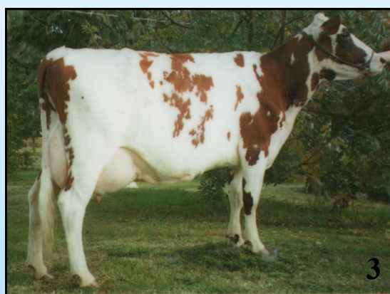
3. Werombi Milk Charelle (EX 2E) - 1st prize Sydney Royal, 1st prize Camden Show, 2 time All Australian Cow, Production (lifetime) 56676l, 1809kg P, 2410kg F, Top lactation: 8296l, 256kg P, 334kg F.