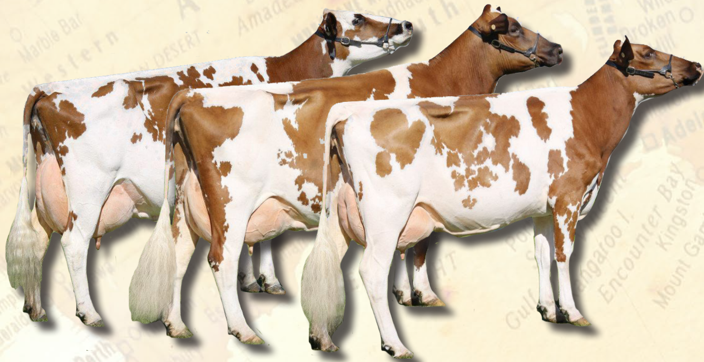
Boldview Pardner Bride VG 89 Reserve Senior Champion 1st Aged Cow in Milk 1st Type & Production Adelaide. 2012