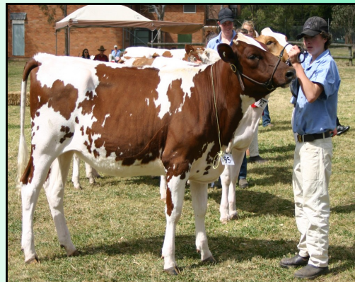
Reserve Senior Champion Paschendaale Frontline Eagles Partnership