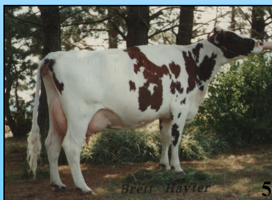
5. Parkvale Rebel Alice (EX 3E) - 2 time Camden Show Champion, 2 time Supreme Dairy Cow Camden, 2 time Reserve Champion Sydney Royal, 3 time Best Udder Sydney Royal, 2 time Champion Hawkesbury, All Australian Cow, 3 Sydney Royal Champion Daughters, Champ. NSW On Farm Challenge, Production (lifetime): 58212l, 2175kg P, 2820kg F.