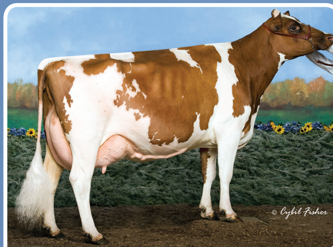
dam: Palmyra Calimero R Bethany-ET VG-88

3rd Dam: Palmyra Reno Bethany EX-90 Lifetime - 120,700M 3.7%F 4496lbsF 3.2%P 3855lbsP