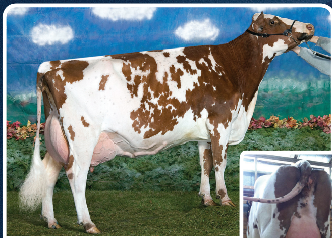
dam: Blackaddar Olympic Model EX 96 4E 2* (above & right)