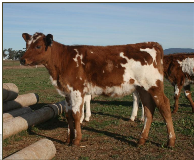
Paschendaele Klassy Burd