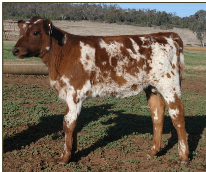
Paschendaele Klassy Boy