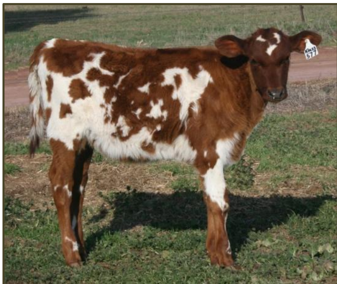
Paschendaele Klassy Girl