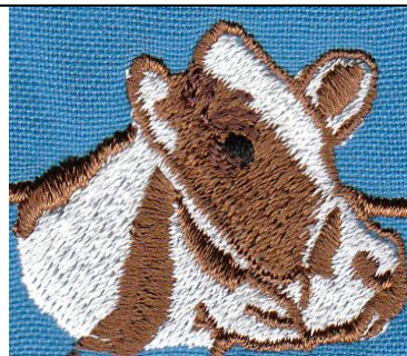
Stud Logo – Dehorned