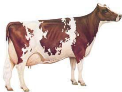
Whole Ayrshire Cow