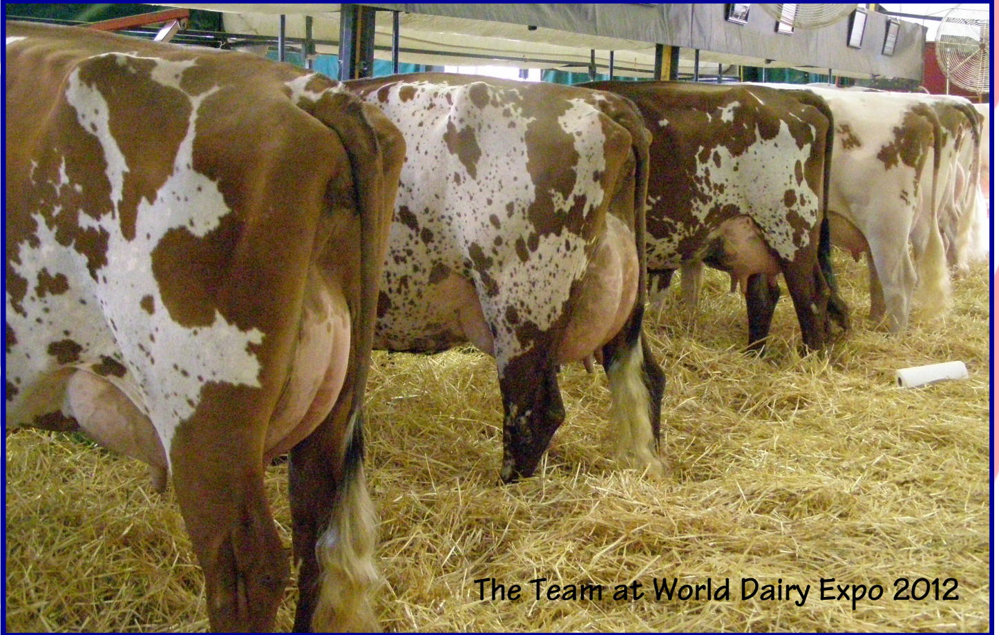
The Team at World Dairy Expo 2012

Left to Right: Palmyra Calimero J Rosy, Palmyra Bendig Bonnie, Palmyra Poker Brook's Belle, Palmyra Ambush Randy and Palmyra Poker LH Rosy