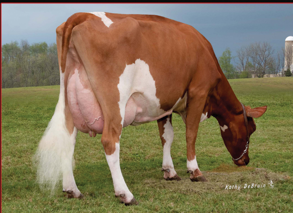
Daughter: VAN-DE ORKKO CRICKET CROQUET Ranked #3 Elite CPI Cow April 2013 2-07 314D 21,610M (9,802 kg) 4.6% 986F 3.8% 815P