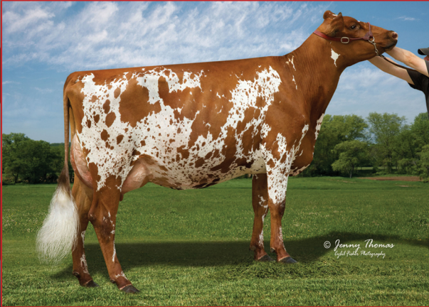
Daughter: PALMYRA BENDIG R BONNIE, VG-89 Ranked #1 Elite CPI Cow April 2013 2-00 305D 20,490M (9,294 kg) 4.3% 888F 3.2% 655P Nom. All-American Jr. 2-Year-Old, 2012