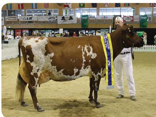
■ Premier Danehill Frost, E8-9 NZ Dairy Event Champion 2012/13