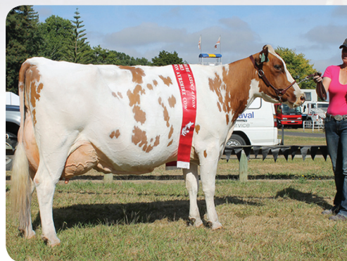
■ Brookview Lot Laguna, E9-9 North Island Champion 2012/13 Reserve Champion Royal 2012/13