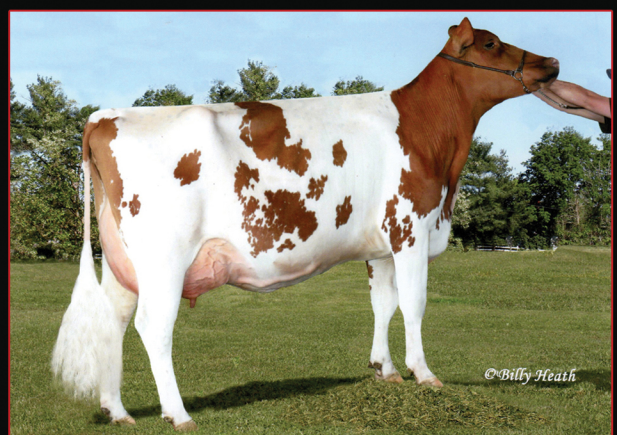
Dam PALMYRA CALIMERO R. BAILEY-ET, VG-89 Ranked #5 Elite CPI Cow April 2013 3-07 365D 29,374M (13,324 kg) 4.5% 1309F 3.3% 959P