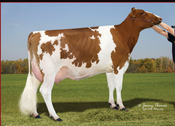
Daughter: PALMYRA REALITY BAILEY-ET, VG-86 Ranked #7 Elite CPI Cow April 2013 2-02 305D ME 22,520M (10,215 kg) 4.7% 1059F 3.2% 714P