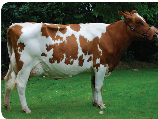
■ Glenmore River Star, V7-8 South Island Champion 2012/13