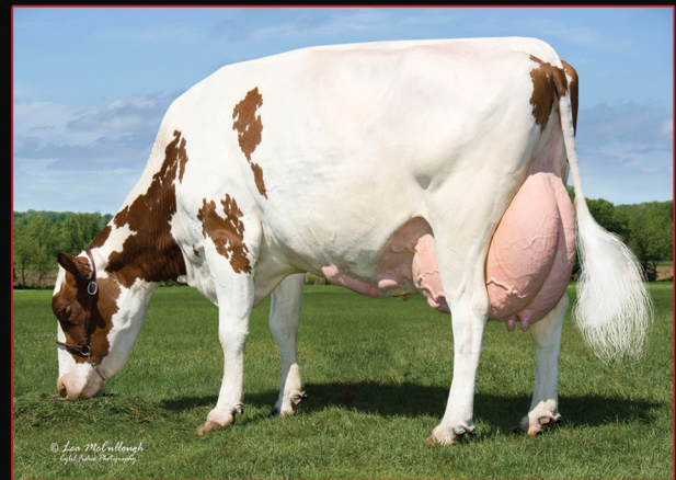
Dam VAN-DE JERRY K-T-DID CRICKET, EX-92 Ranked #2 Elite CPI Cow December 2012 5-02 341D 28,640M (12,991 kg) 4.1% 1176F 3.4% 984P