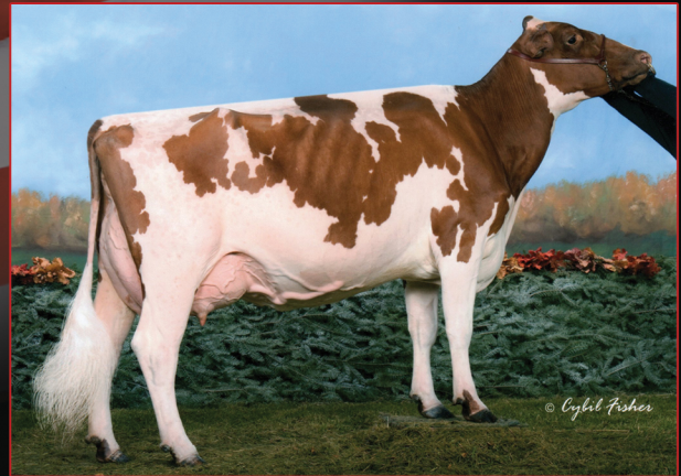
Dam PALMYRA REALITY BONNIE-ET, VG-88 Ranked #2 Elite CPI Cow April 2013 3-08 311D 24,850M (11,272 kg) 5.0% 1250F 3.3% 829P HM All-American Sr. 3-Year-Old, 2010